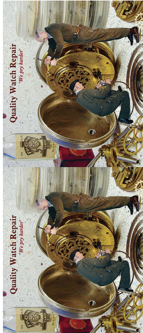
Quality Watch Repair

3D images can be viewed by various means of projection, with hand-held viewers, and as digital displays on phones, tablets or your personal computer.